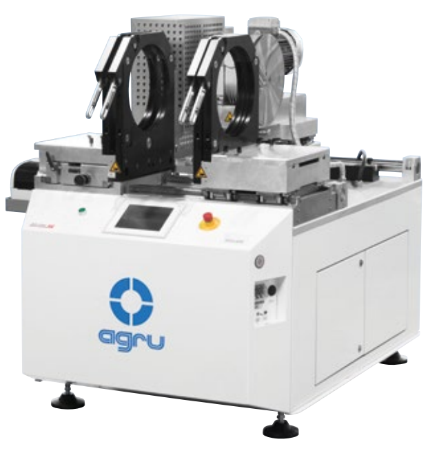
Weldingmachine SP 315-S