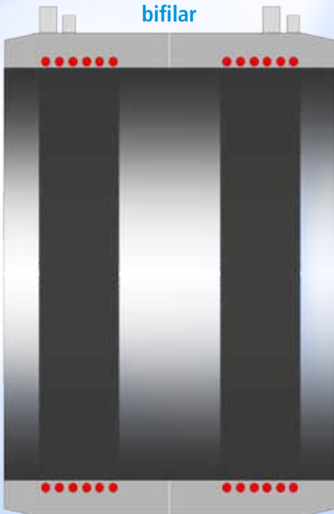
Large EF-coupler bifilar